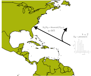
Figure 1: Hurricane model

The insurance industry exposes itself annually to losses from hurricanes. To date the most costly year was 2005 when hurricanes Katrina, Rita and Wilma caused insurance losses of USD83bn (source, Swiss Re Sigma). Seasonal weather forecasting methods are becoming more sophisticated [1] and the time may eventually come when useful forecasts can be made about possible landfall events in the coming year. It is likely that the skill and capabilities of these forecasts will increase over the coming decades. This paper seeks to investigate whether 'limited information forecasts' are of use to a hypothetical insurer and how allowance for climate trends affects profitability. The paper notes that, with very deep uncertainty, it is very difficult to distinguish between an underwriter who is good or just lucky.