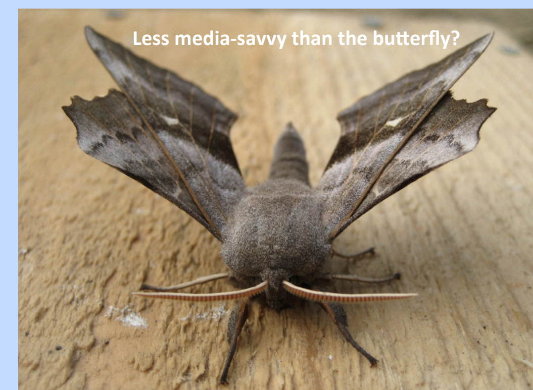
Less media-savvy than the butterfly?

Climate decision-makers and climate model developers must take this into account.