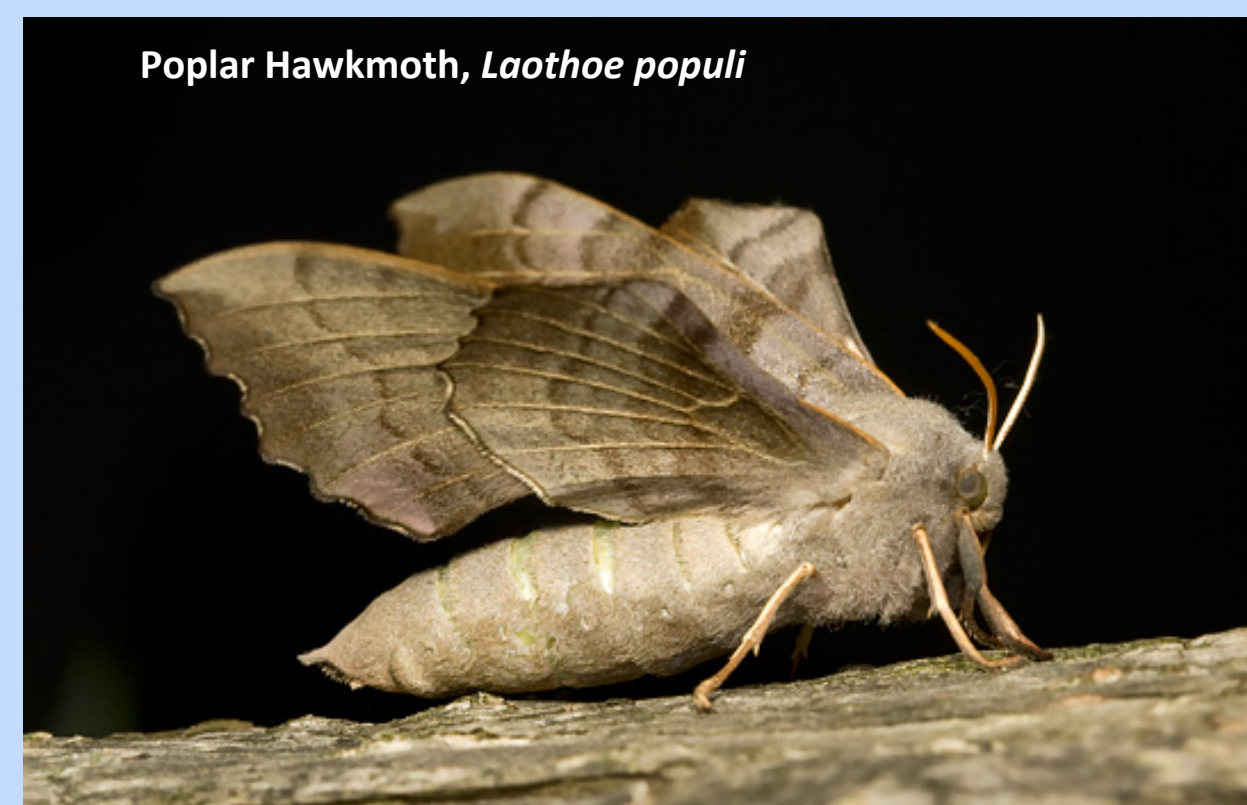
Poplar Hawkmoth, Laotloe populi

Another assumption is that the ensemble of models available provides a good estimate of the range of all possible model structures (see literature on discrepancy ). Climate models share assumptions, language, developers, and even code. They cannot possibly be a meaningfully “random sample” of model space.